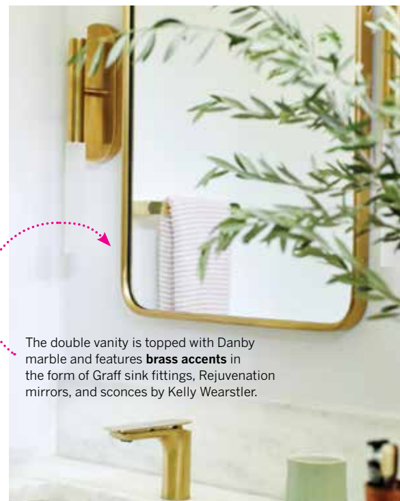
The double vanity is topped with Danby marble and features brass accents in the form of Graff sink fittings, Rejuvenation mirrors, and sconces by Kelly Wearstler.